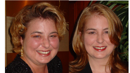
With Cushing's Normal Appearance

* Rapid discontinuation of steroid medication can be life threatening and needs to be done under the supervision of a physician.